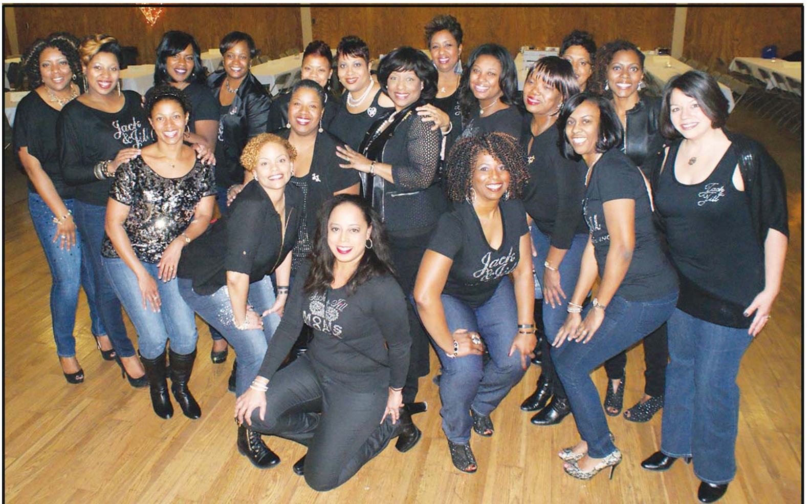
The women of The Jack and Jill foundation